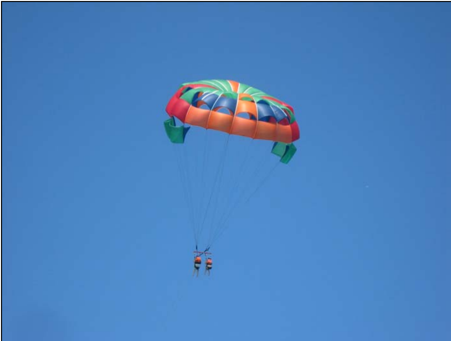
Figure out exactly what it is that you want and go for it!